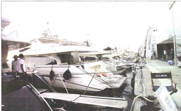
Around 200 luxury boats are on display.

BEIRUT: The entrance to the Beirut Boat Show 2014 offered a stunning view of the hundreds of millions of dollars-worth of luxury boats docked in the otherwise industrial and somewhat decrepit port area.